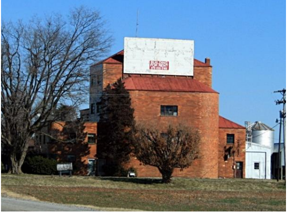
Broadbent Seed & Ham Building

*NOTE: Bon Appetit rates Broadbent Hams one of the <u>top 5</u> country hams in the U.S with other competitions consistently ranking them #1 or #2.