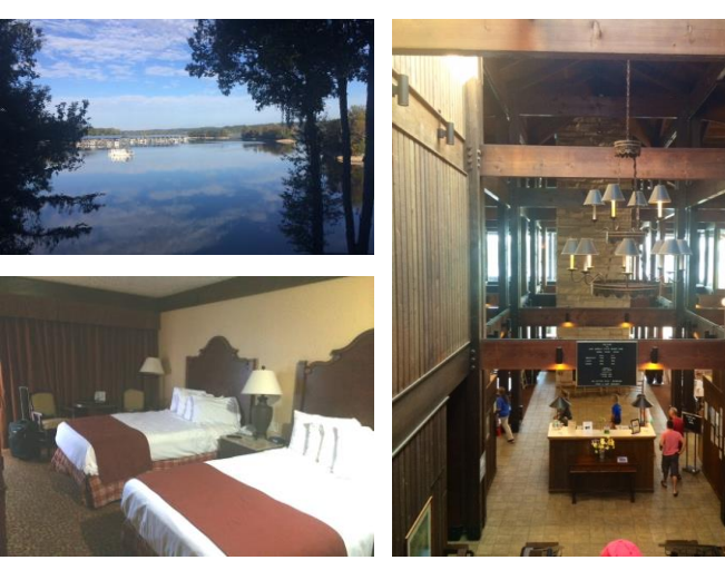
The view into the Dinina Area

Lake Barkley State Resort Park, once considered the premier state resort park in Kentucky with breathtaking views, amazing architecture, and numerous amenities, has always been a major draw. A recent stay at the Park found the lodge rooms themselves very clean, the bath facilities updated and the