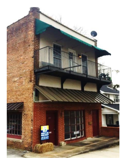
Old Cadiz Theater